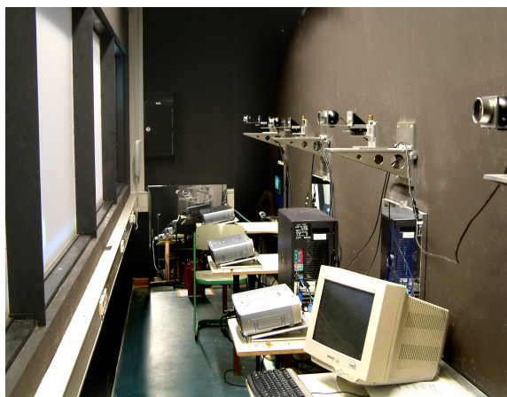
Figure 2: A backstage view of the interactive datawall.

pointer with a touch sensitive tip. When the pen touches on the screen, the laser lights up. The vision system uses four regular web cams to capture a video image from the back of the datawall, in order to track the red laser spot, see Figure 3. The laser pointer's position is mapped into the coordinates of the display system which runs a Java-based client program emulating a mouse device.