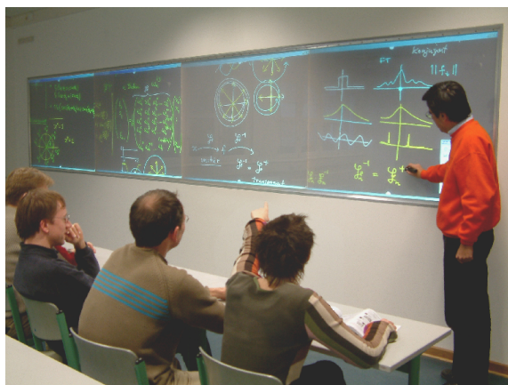
Figure 1: Using the interactive data wall with E-Chalk for a mathematics course.

provides a whiteboard with real time inking , which can be annotated by local and remote users.